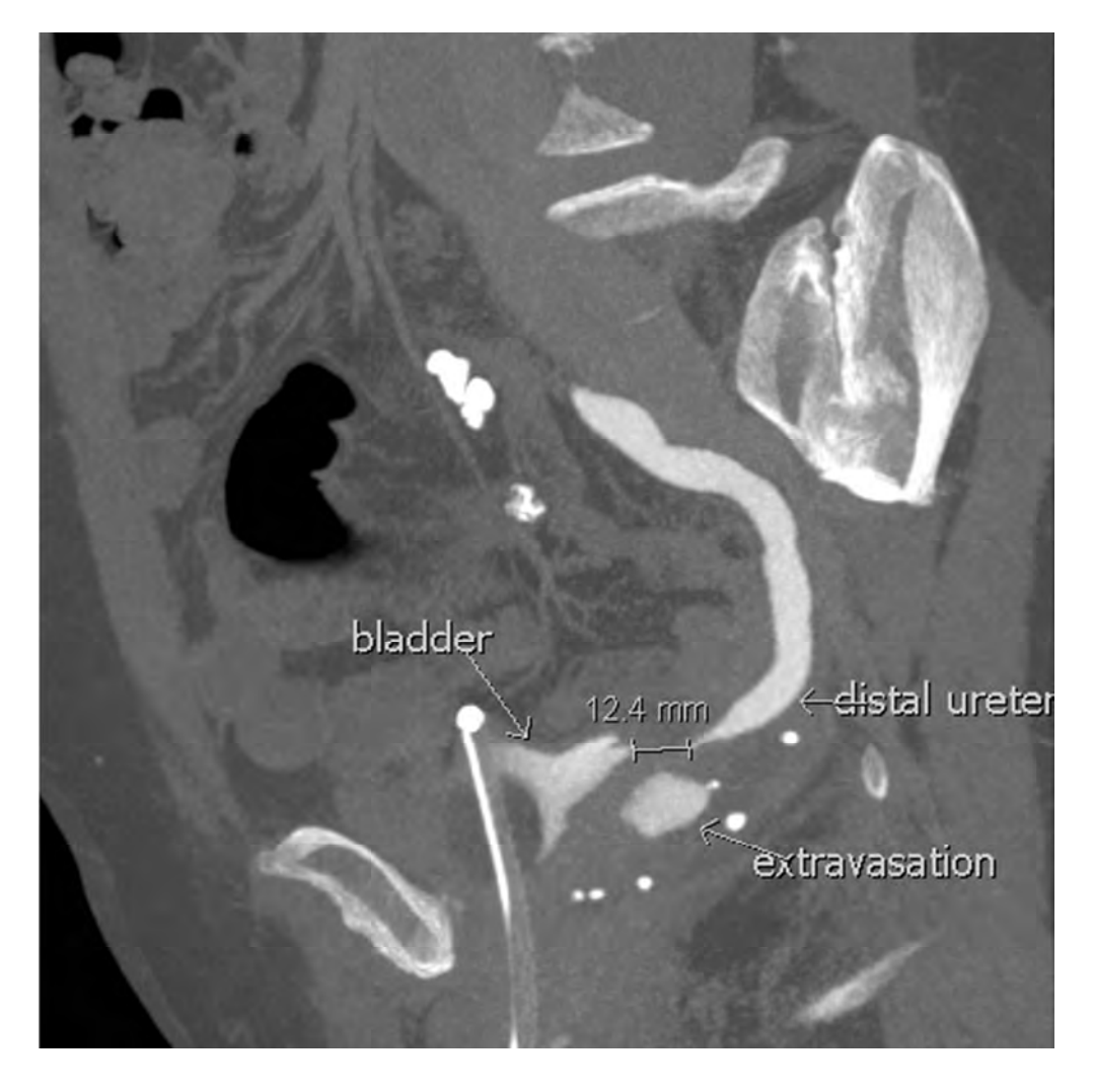
Figure 7 135x135mm (96 x 96 DPI)