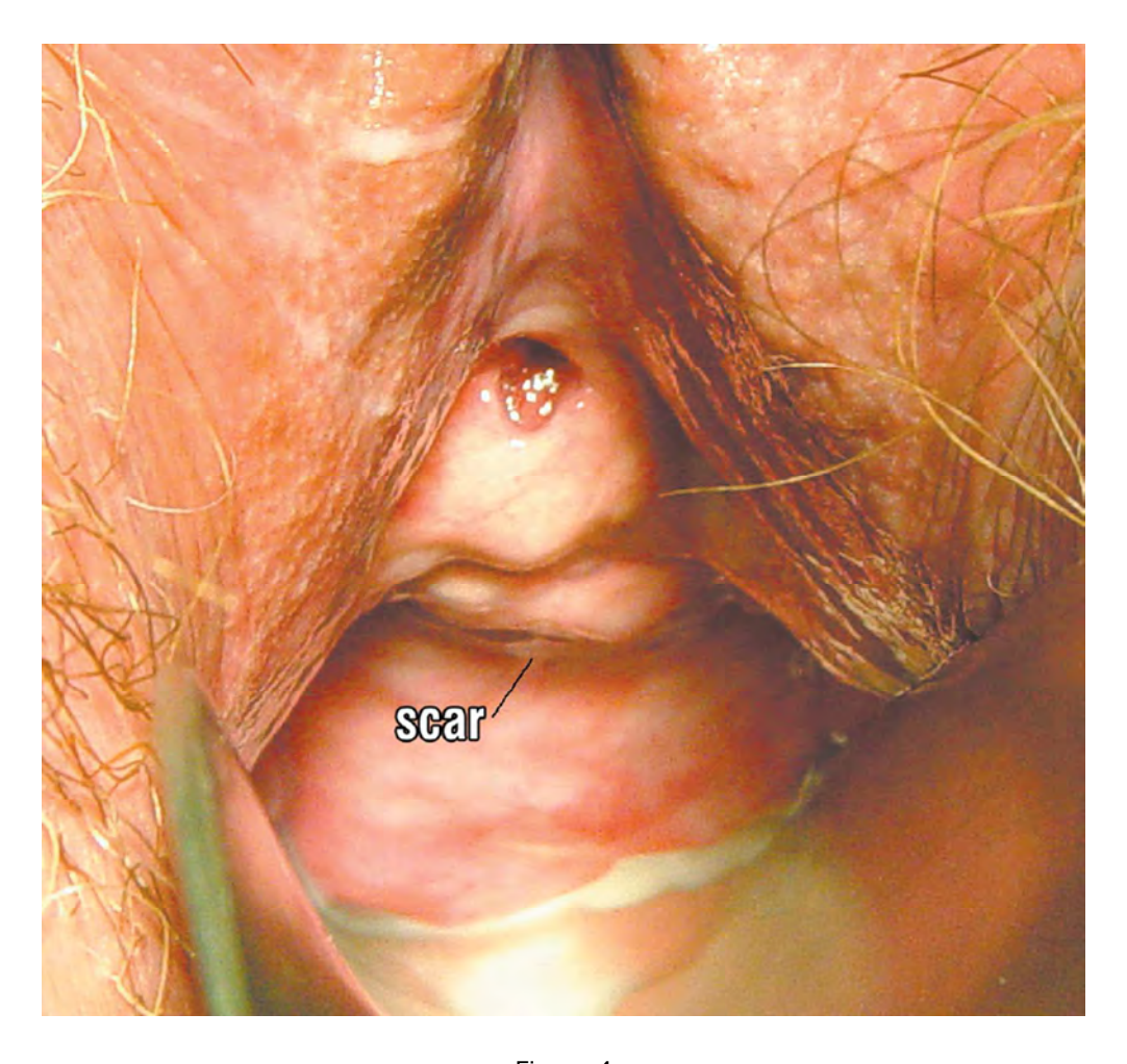
Figure 4 227x212mm (96 x 96 DPI)