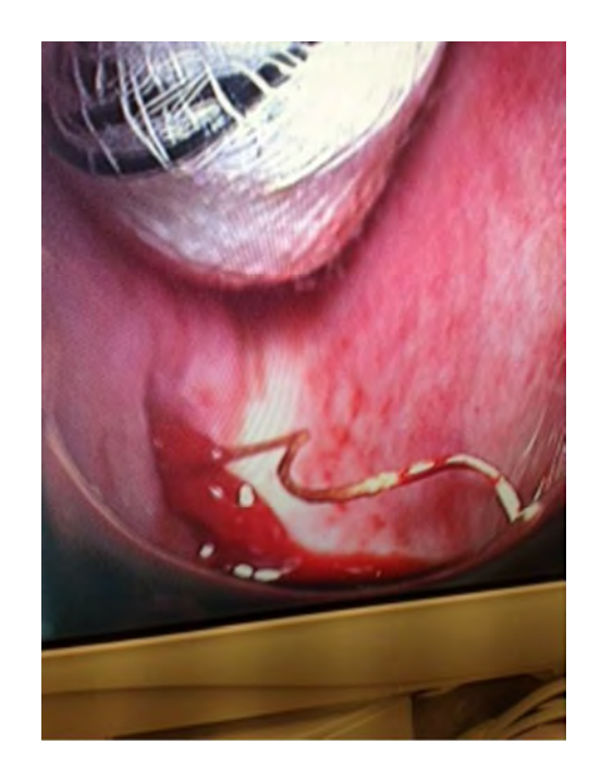
Figure 8 84x112mm (72 x 72 DPI)