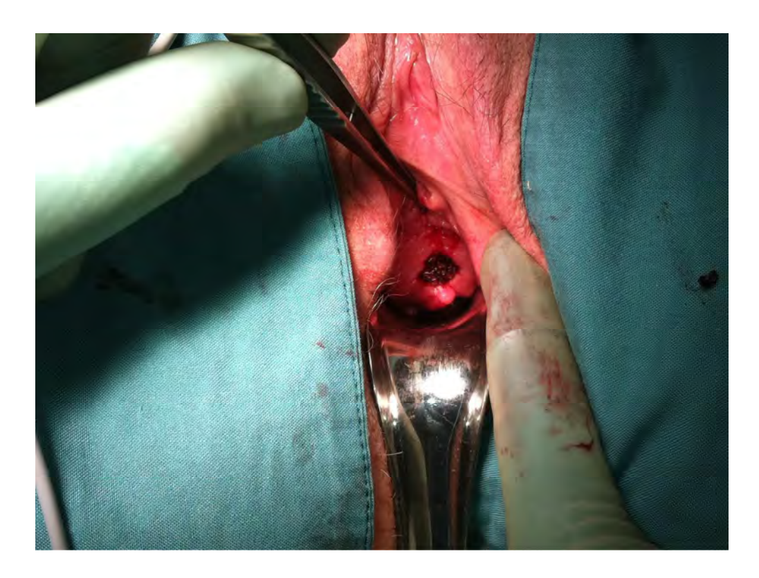
Figure 1 609x455mm (72 x 72 DPI)